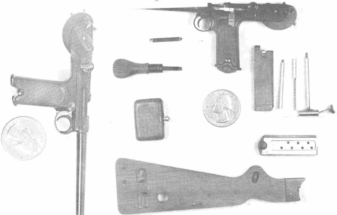
Photo 4: Picture of the entire Borchardt outfit out of the case with all of the accessories and loading tools, oilers, and screw drivers evident.